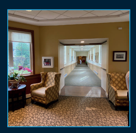
Independent Living B Wing: $100,000

We'd love to discuss the many Naming Opportunities available throughout Lions Gate Please contact: Lisa Goldwasser • (856) 679-2189 • Igoldwasser@lionsgateccrc.org