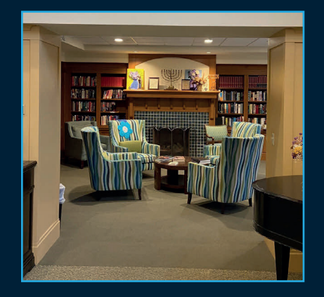
Assisted Living Library: $50,000