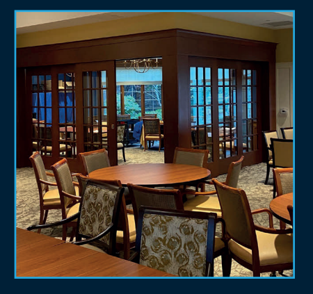
Independent Living Private Dining Room: $25,000