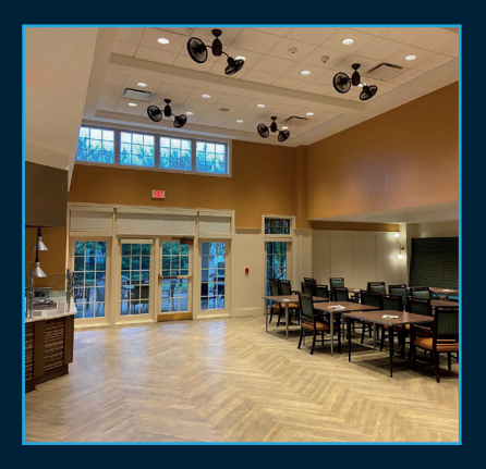
Independent Living Bistro: $125,000