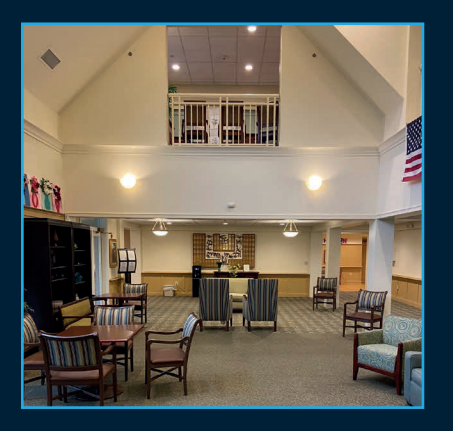
Assisted Living Living Room: $50,000