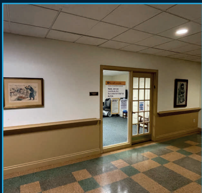
Wellness Center: $100,000