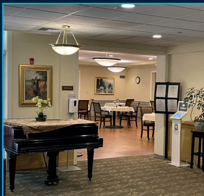
Assisted Living Dining Room (1st Floor): $36,000