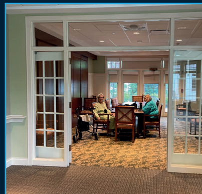
Independent Living Media Room: $50,000