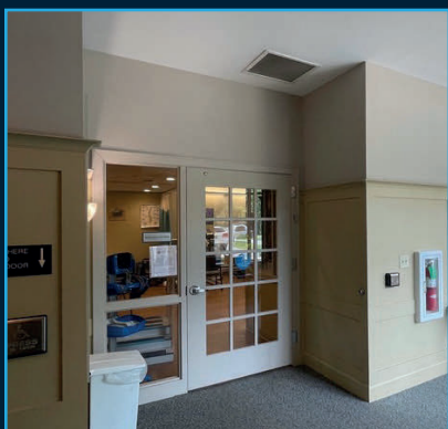
Rehab Entrance: $100,000