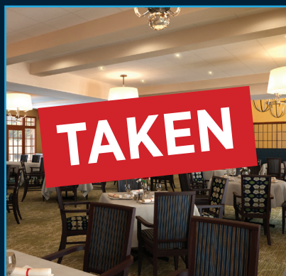
Independent Living Private Dining Room: $25,000