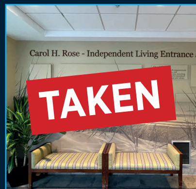
IL Entrance Mural: $100,000

We'd love to discuss the many Naming Opportunities available throughout Lions Gate Please contact: Lisa Goldwasser • (856) 679-2189 • lgoldwasser@lionsgateccrc.org