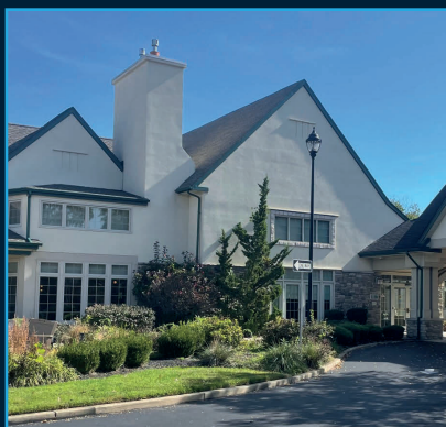
Lions Gate Campus 1110: $5,000,000