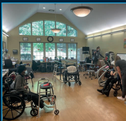
Rehab PT/OT Treatment Room: $50,000