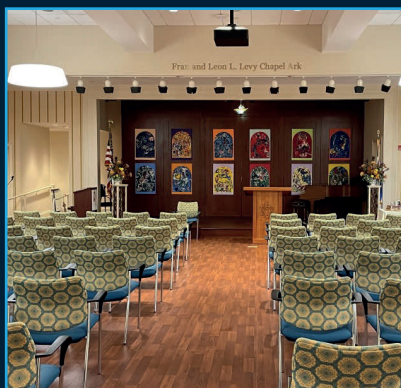
Independent Living Commons Hall: $500,000