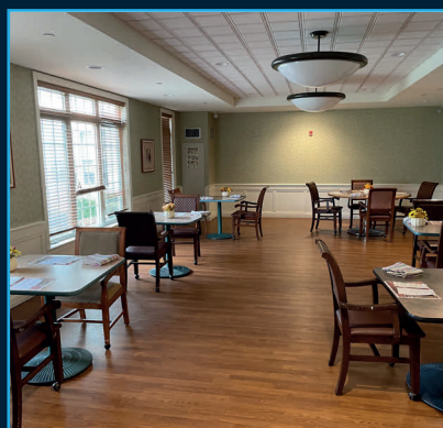
Skilled Nursing Dining Room (1st Floor): $25,000