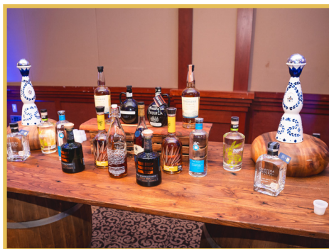
Tequila Tasting Table