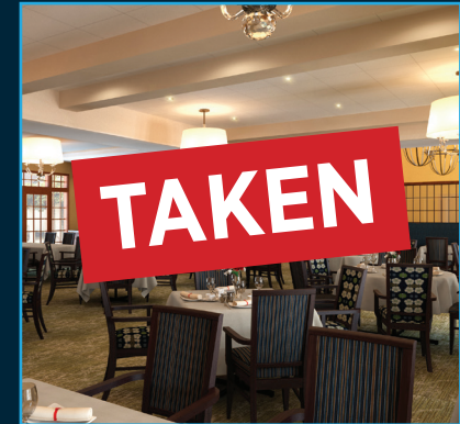
Independent Living Private Dining Room: $25,000