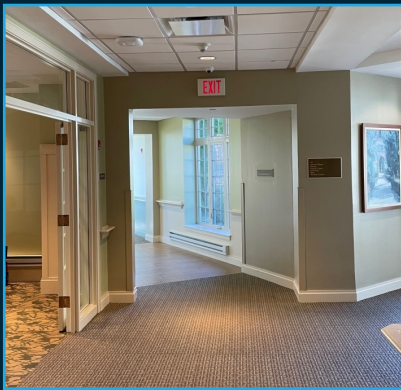
Independent Living A Wing: $100,000