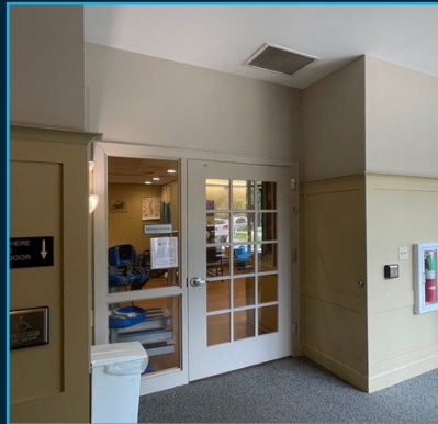
Rehab Entrance: $100,000