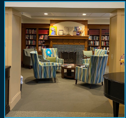
Assisted Living Library: $50,000