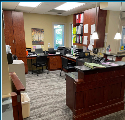
Nurse's Station in Rehabilitation: $18,000