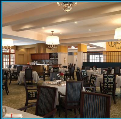
Independent Living Dining Room: $125,000