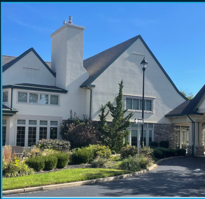
Lions Gate Campus 1110 $5,000,000