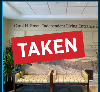
Independent Living Entrance Mural: $100,000