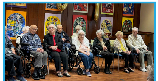
Centenarians inducted into the Lions Gate 100 Club

Wishing all of Lions Gate centenarians continued good health and much happiness.