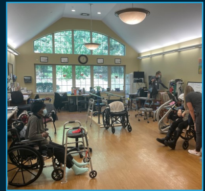
Rehab PT/OT Treatment Room $50,000