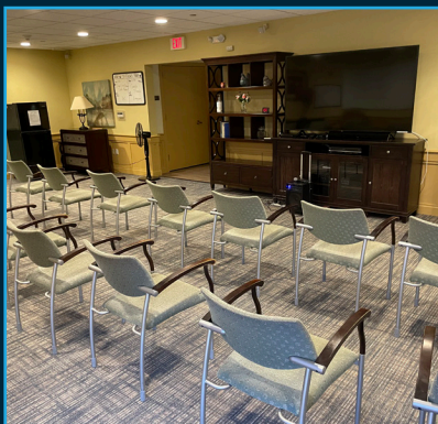
Assisted Living Media Room $36,000