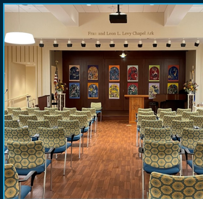
Independent Living Commons Hall: $500,000