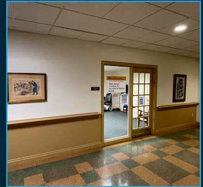
Independent Living Wellness Center: $100,000