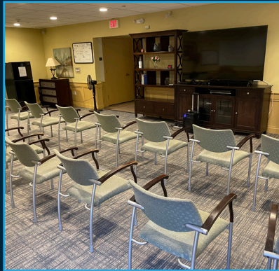
Assisted Living Media Room $36,000