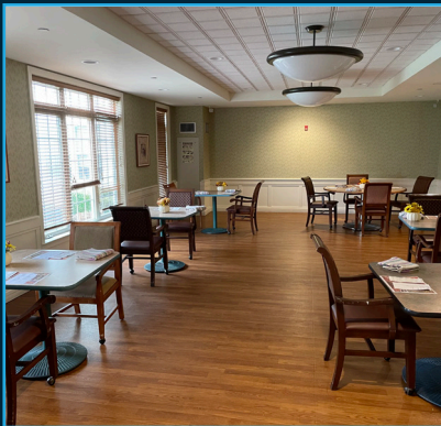
Skilled Nursing Dining Room (1st Floor): $25,000