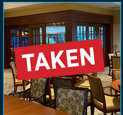
Independent Living Private Dining Room: $25,000