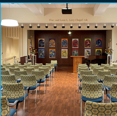
Independent Living Commons Hall: $500,000