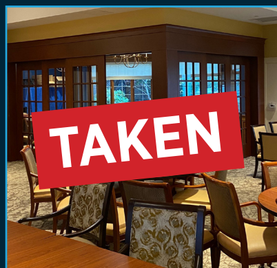
Independent Living Private Dining Room: $25,000