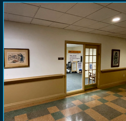
Independent Living Wellness Center: $100,000