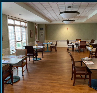
Skilled Nursing Dining Room (1st Floor): $25,000